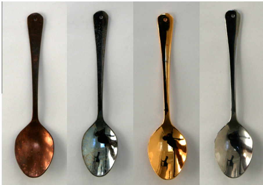
Fig. 1. The spoons used in this study. From left to right: Copper, zinc, gold, and stainless steel.

were instructed to place the spoon into their mouth in order to taste/evaluate the sample.